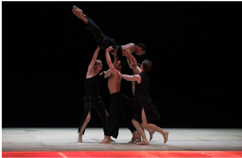
Boston Ballet in Wayne McGregor's Obsidian Tear